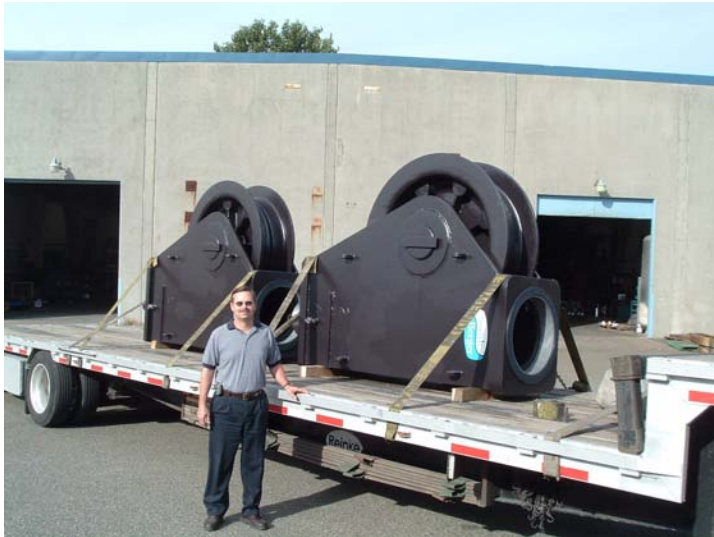
Underwater Fairleads for 3-3/4" Chain