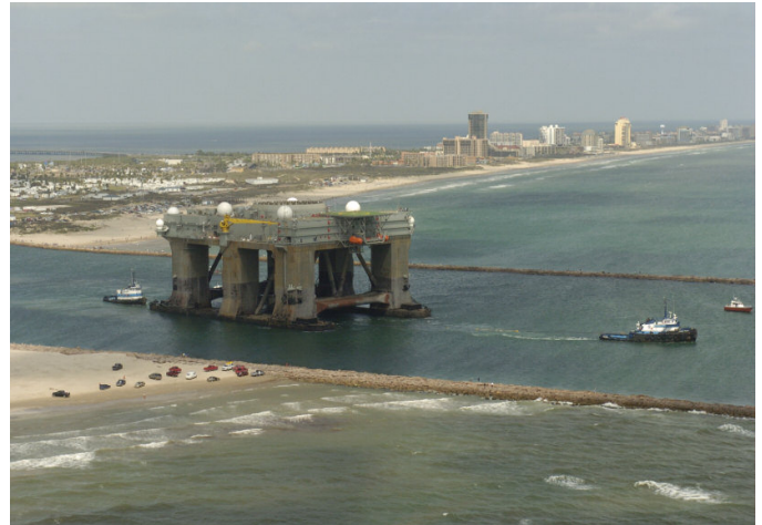
Boeing SBX Platform—Tow Out from AMFELS