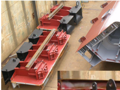
Underwater Fairleads for 5" studless chain.