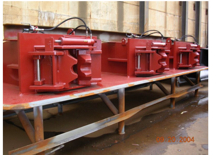
Forward Dual Pawl Bellmouth Chain Stoppers ready for installation onto the FSO.

Rely on Smith Berger engineers to custom design our products for your particular operating practices or conditions. Our goal is to exceed your expectations.