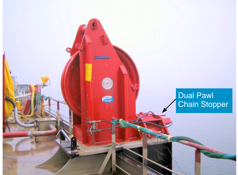
ConocoPhillips FSO "Nabarima"