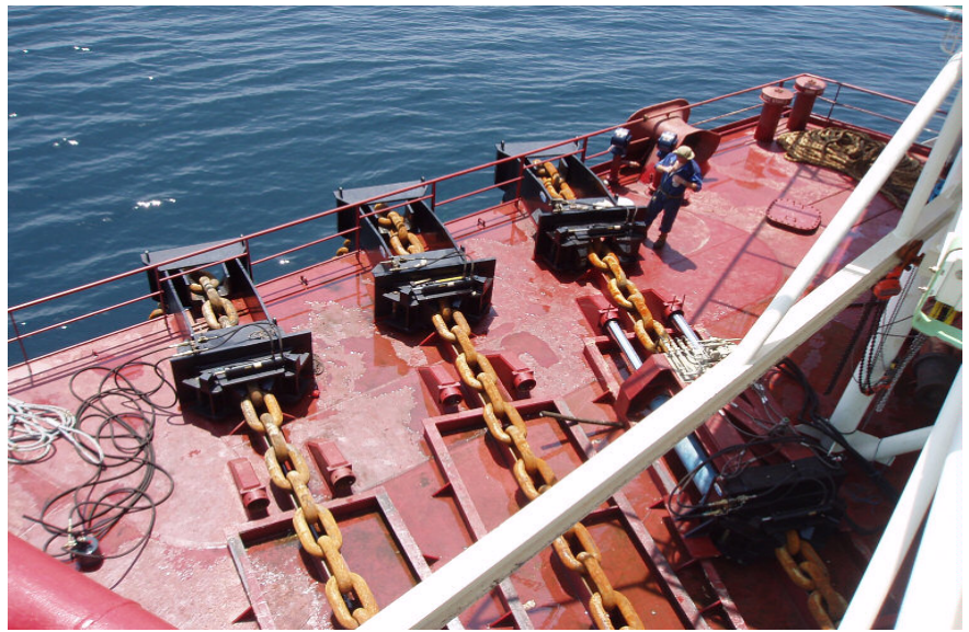
Perenco S.A. FSO "Fernan Vaz"