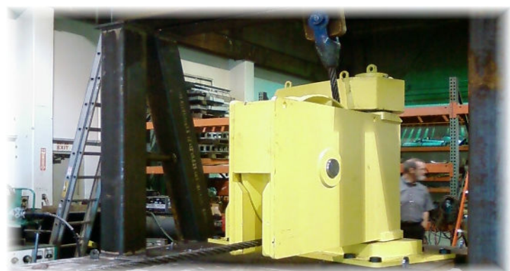
Load Testing in Seattle, USA

Smith Berger Marine, Inc. - Mooring & Towing Solutions