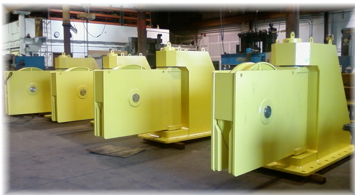
Flag Blocks Ready for Shipment