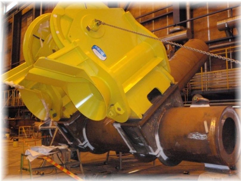
Installation in Pori, Finland