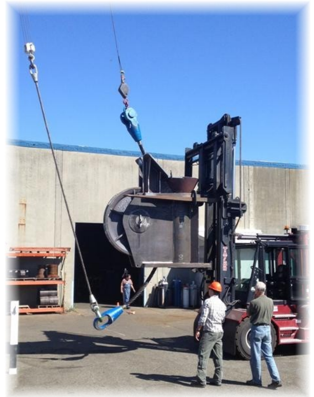
Pass Through Test in Seattle, USA

Smith Berger Marine, Inc. - Mooring & Towing Solutions