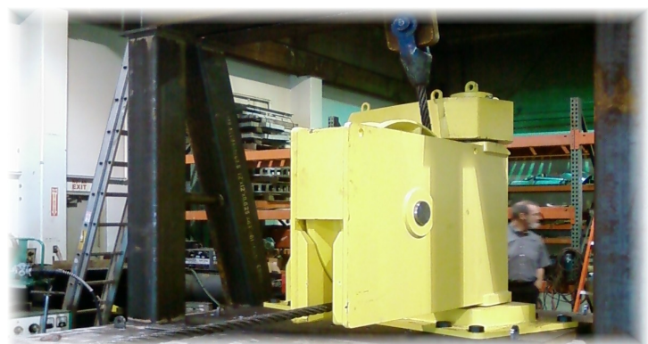
Load Testing in Seattle, USA